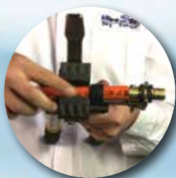
Set the fitting and the pipe in the tool