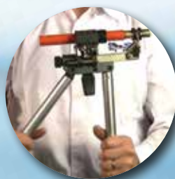
Connect the fitting and the sleeve to the pipe - in single step