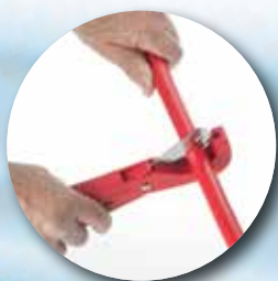
Cut the pipe